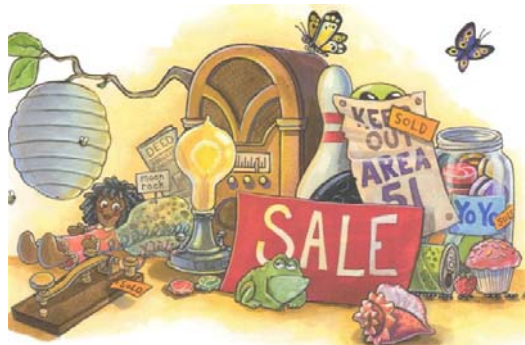
Art © 2005 Guy Francis